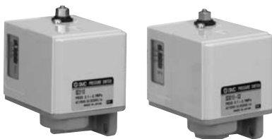
IS3110 (Gasket piping)