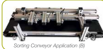
Sorting Conveyor Application (B)