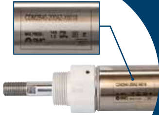
Laser Etch Cylinders