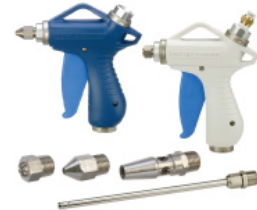
Blow Guns & Nozzles