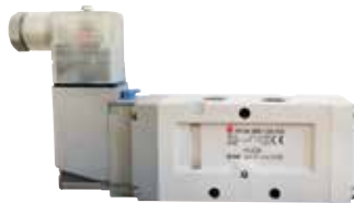
Directional Control Solenoid Valves