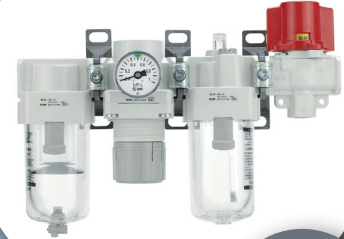
Filter/ Regulator Lubricators