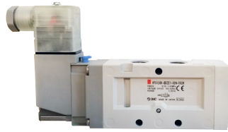
Directional Control Solenoid Valves