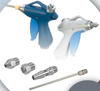
Blow Guns & Nozzles