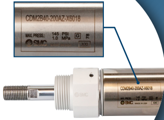
Laser Etch Cylinders