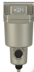
Process Gas Equipment