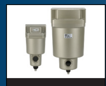
Water Removal Units