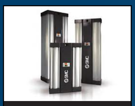
Desiccant Air Dryers