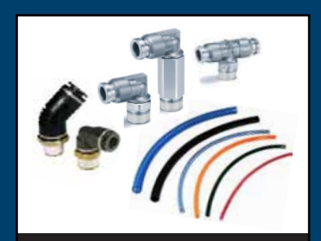
UV Resistant Fittings/Tubing