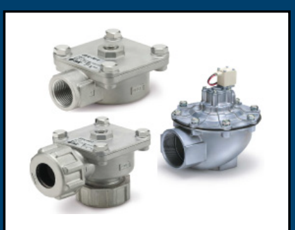
Jet Pulse Dust Collector Valves