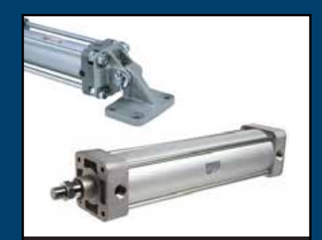
Tie Rod Cylinders