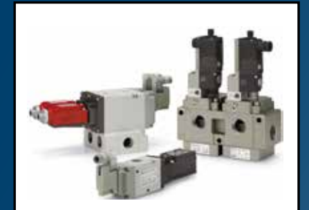
Category 3/4 Safety Valves