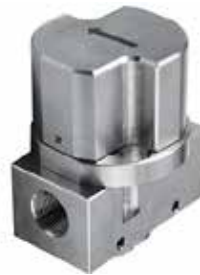
SUS Lockout- Tagout (LOTO)