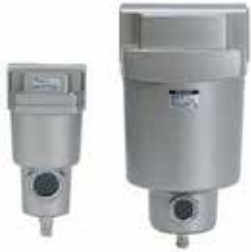
Water Removal Units