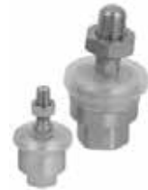
SUS Floating Joint with Silicone Cover