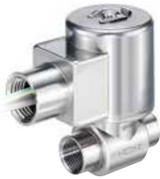
SUS 2-way Solenoid Valve