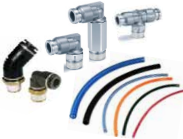
Fittings & Tubing