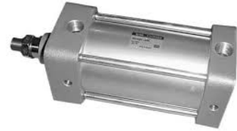
Tie Rod Cylinders with Viton™ Seals