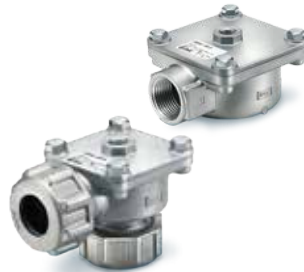
Jet Pulse Dust Collector Valves