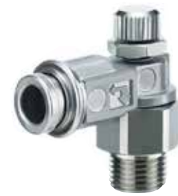
All Metal Speed Controller