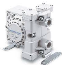
PA POLUPROPYLENE PROCESS PUMP