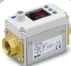
LFE ELECTROMAGNETIC LIQUID FLOW SWITCH