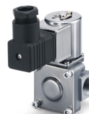
JSXD PILOT OPERATED 2-WAY VALVES