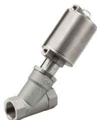
JSB ANGLE SEAT VALVES

Suitable for Air, Water, Oil & Chemicals