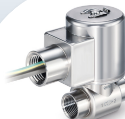
JSXD DIRECT OPERATED 2-WAY VALVES