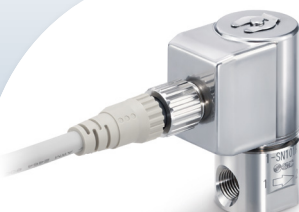
JSX DIRECT OPERATED 2-WAY VALVES