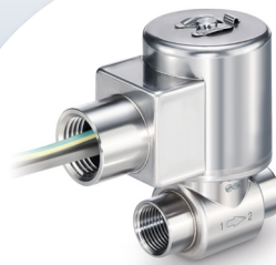
JSXD DIRECT OPERATED 2-WAY VALVES